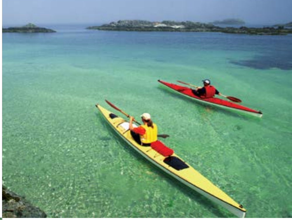
CANADA'S FRIENDLIEST CITY

BEST CITY IN CANADA FOR YOUNG PROFESSIONALS